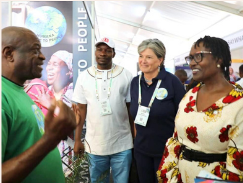
"It is through enabling communities like those I met today that we will end HIV transmissions and end AIDS as a public health threat. You light the way," –Winnie Byanyima UNAIDS Executive Director